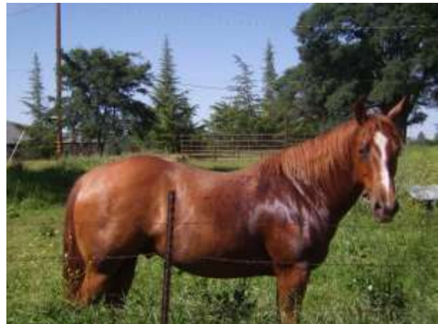
The above picture clearly shows large amount of fluid loss through sweating as this horse cools itself post-workout

Unlike human sweat, horse sweat contains high levels of the electrolyte molecules; 2.8g sodium, 1.4g potassium, 5.3 g chloride, 0.12 g calcium, 0.05 g magnesium per liter of sweat, and is isotonic, meaning that the balance of electrolytes in sweat mirrors that found in blood. The amount of sweat produced by a horse is determined by several factors including how hard the horse is working, the ambient temperature and how fit the horse is (less fit horses sweat more, especially early in the ride) and can range from 4 to 10 liters (1-2.5 gallons) an hour. Total body water is about 65% of body weight, so the 1100lb horse's body contains about 325 liters (87 gallons) of water of which about two thirds is intracellular (inside cells) and the rest extracellular fluid. Four to 10 liters per hour is therefore a loss of between 1-3% of total body water per hour. Dr David Marlin a specialist equine exercise physiologist stated in a recent article in Britain's Horse & Hound magazine that a 1% loss of hydration can lead to a 4% fall in performance. This is not only due to the water loss but because of the large quantity of electrolytes (especially sodium and chloride) that are lost in horse sweat.